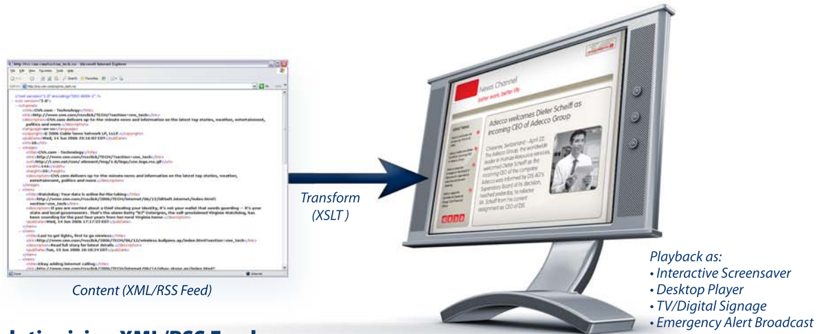
Content (XML/RSS Feed)

Want More Site Visits..? Show Your Newsfeeds!